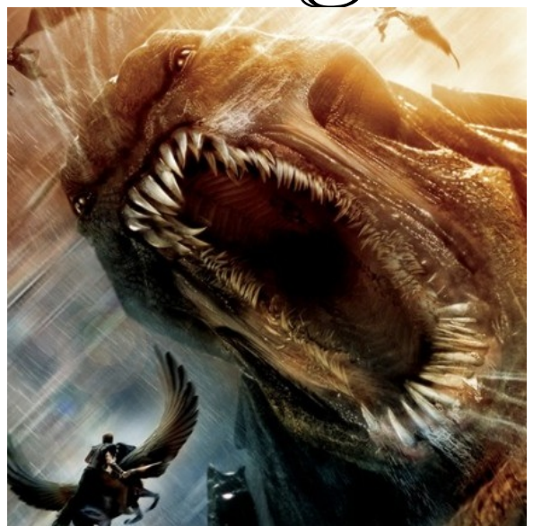
Lincoln University's approach to the AQA Audit Report (working title: the 13 labours of Hercules)